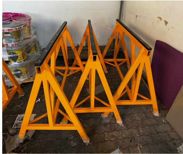
Model "ELSCP" WITH RUBBER SUPPORT Image - N° 3