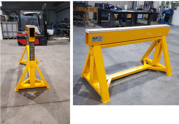
Model "ELSCP" - Image - N° 4 On Request