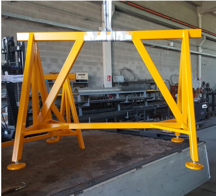
Model "ELSCA" Image - N° 2